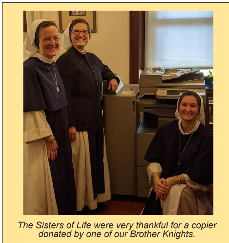
The Sisters of Life were very thankful for a copier donated by one of our Brother Knights.

The other good work we did in January was the Philadelphia March for Life. The Knights showed up in the bitter cold to help keep the pro-life people safe. The pro-life organization was very grateful to the Knights of Columbus for their presence during the march. Good job, I'm proud of you guys! Talking about work, I want to remind everybody that 40 days for Life starts February 17, and the pro-life organization is looking for people to pray in front of the abortion clinics in