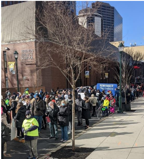
March for Life, January 2021

Philadelphia. Father Ryan council has volunteered to cover the abortion clinic on February 20 from 8:00 a.m. to 2:00 p.m. If you are available come out to show the community what the Knights of Columbus can do please contact me, and I'll let you know where you are needed.